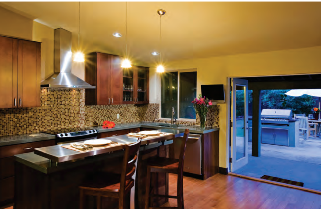
"Green Street" http://www.greenstreetdev.com

Finding ways to fight the challenges of the eco confusion, King offers a solution. "I provide a 'single source resource' for a homeowner that is interested in retrofitting their home to be energy efficient. We provide the education on what that means, and we provide all the resources they would need. It's what I call the eco road map: the contractors, the lenders, the title companies, and everyone along the continuum to make their home more energy efficient."